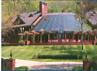
The Mansion at Fontanel.