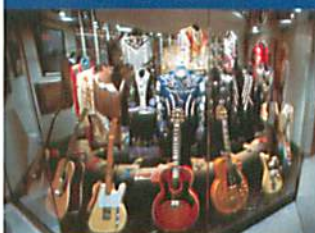
Country Music Hall of Fame.