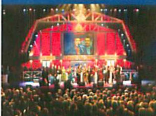
Famous Grand Ole Opry.

Departure: Citizens Bank and Trust, 5101 5th Ave, Eastman, GA @ 8 am then Cochran Bank and Trust, Cochran, GA & Citizens Bank & Trust, Warner Robbins, GA