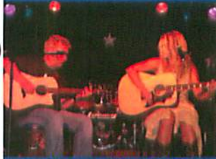
Nashville Nightlife Dinner Theater.